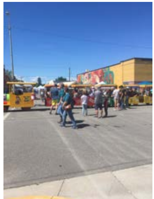
Al Bedoo Clown Train Was a hit in Big Timber!