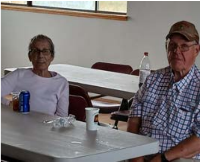
Pig Roast and campout