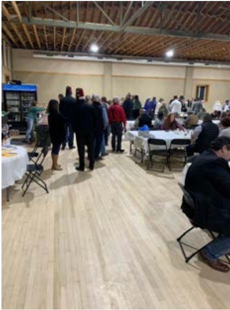
American Legion Hall