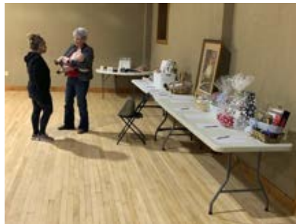
American Legion Hall