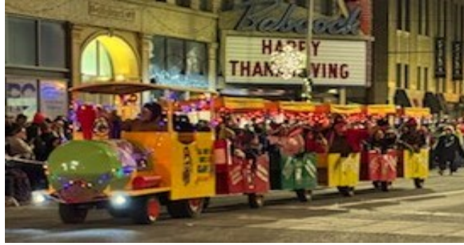
Al Bedoo Clown Train