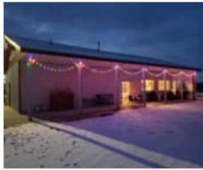
Al Bedoo Temple