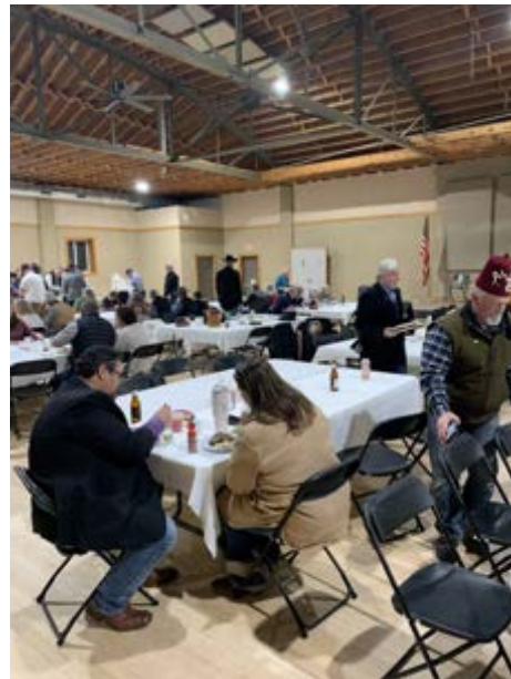
American Legion Hall