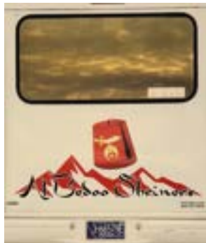
Our new Logo for our Transportation Van