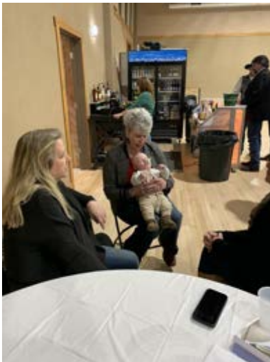
American Legion Hall