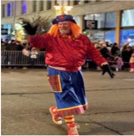
Illustrious Sir Casey Dubbs