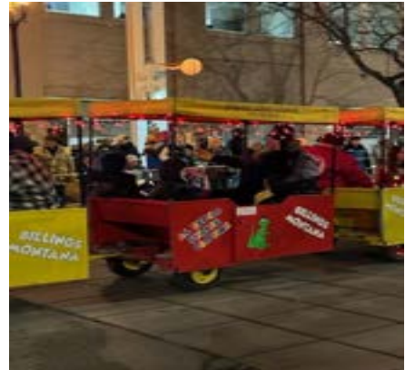
Al Bedoo Clown Train

====> SPECIAL HOLIDAY CONTRIBUTION! ====>