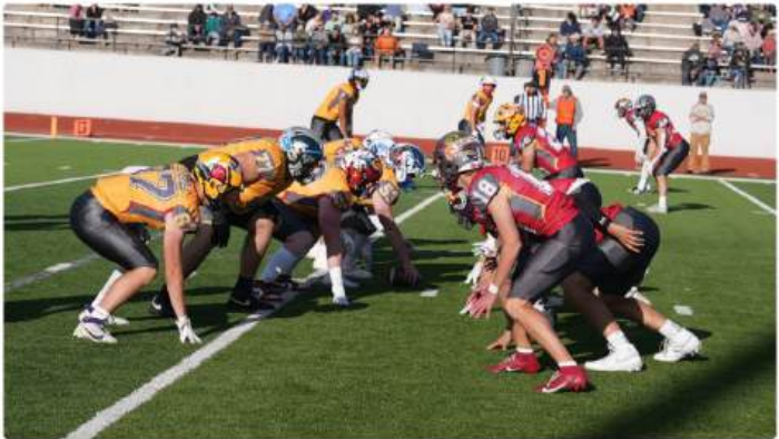
The East (in yellow) takes on the West during the 78th Montana Shrine football game on Saturday, June 21, 2025, at Memorial Stadium in Great Falls.