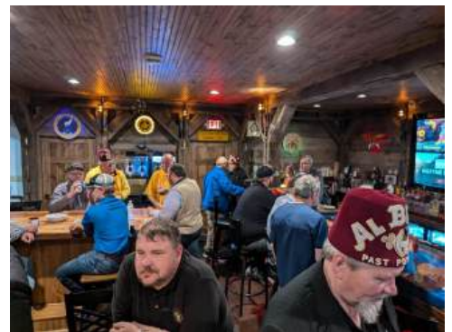
Shrine Family Gathering